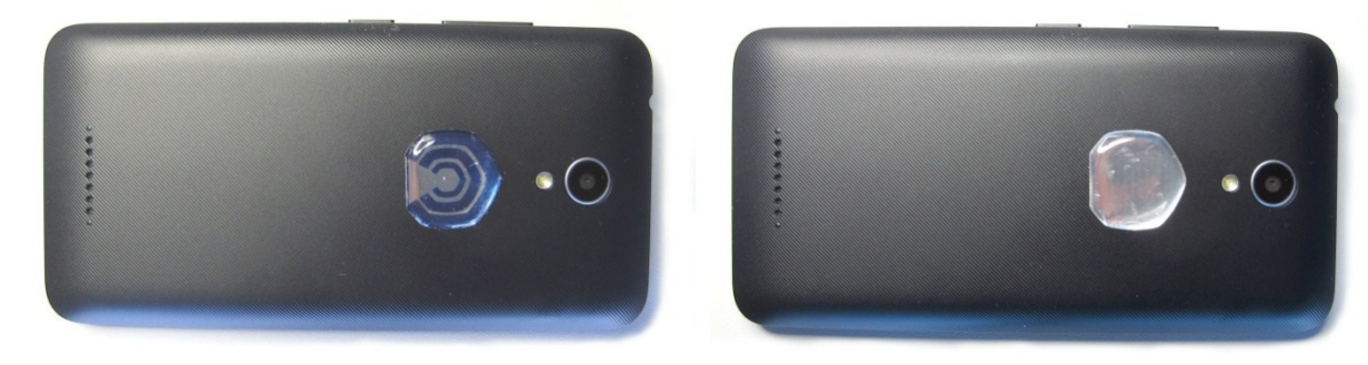
Figure 1: The Perun PROTECTOR (left) and control sticker (right) used for the purpose of testing. Both stickers were covered with other sticker during testing.