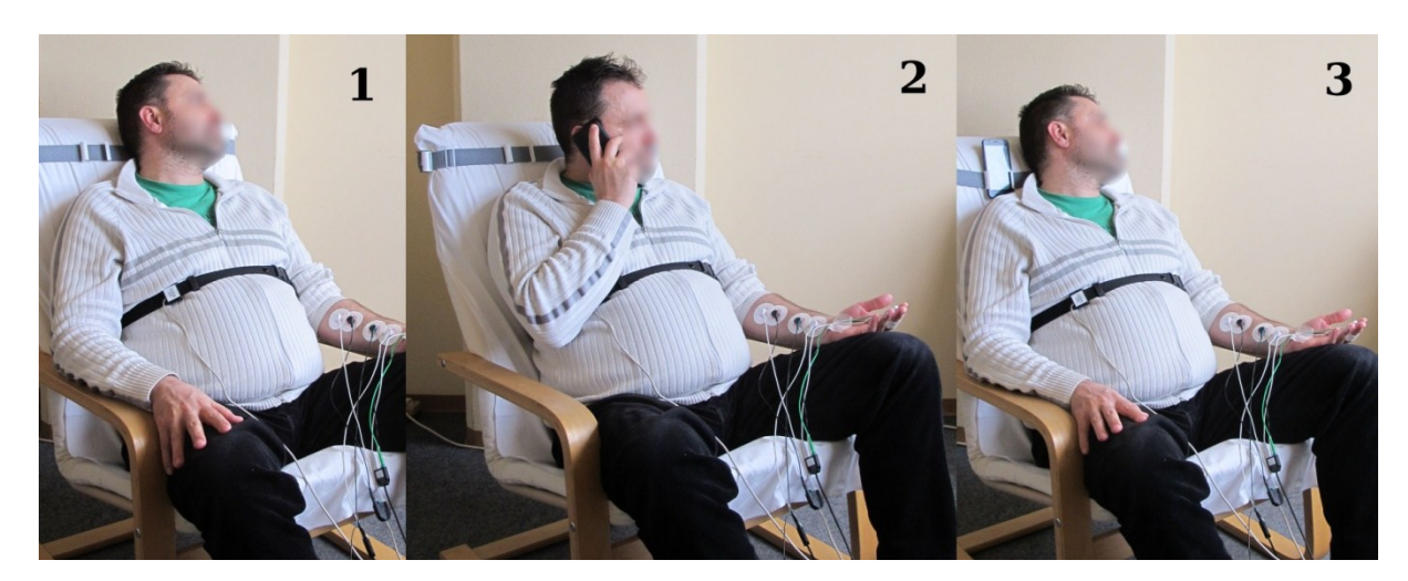
Figure 2: Situation during all three phases of testing: (1) preparation, (2) calling and (3) standby phase.